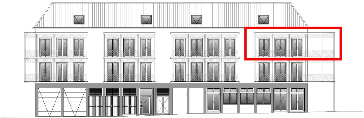
Left Side Facade